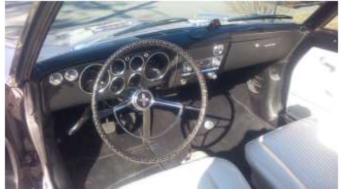
The view from behind the wheel