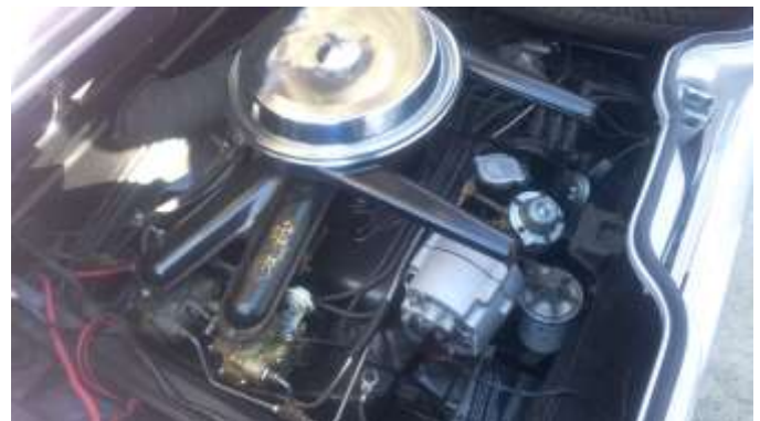
The 164 cubic inch, 140 horsepower, 4 carburetor engine.