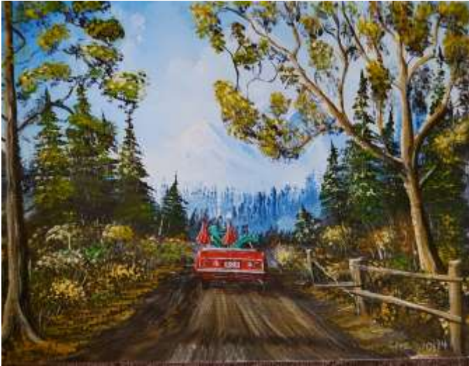
"The Dragon Goes for a Drive... in a Corvair!" Painted as an auction item for Saint George's School, back in the 90s. If memory serves, a later version was actually donated and auctioned off.

I recently attended the Inland Car Club Council's Show No Shine Event, known this year as the Monster Mash. It was a grand affair with nearly 200 people. As near as I could tell, I and one other individual were the only active members of the Inland Northwest Corvair Club in attendance. I had been hoping that we would have had more of our folks there. And in hindsight I realized that we could have put together and donated a gift basket for the prize raffle. I keep wondering why it seems we do not want to get involved with the other car clubs in the area.