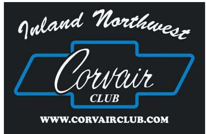
The front of the card looks like this.