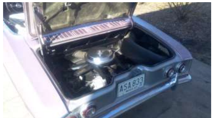
Another view of the engine compartment