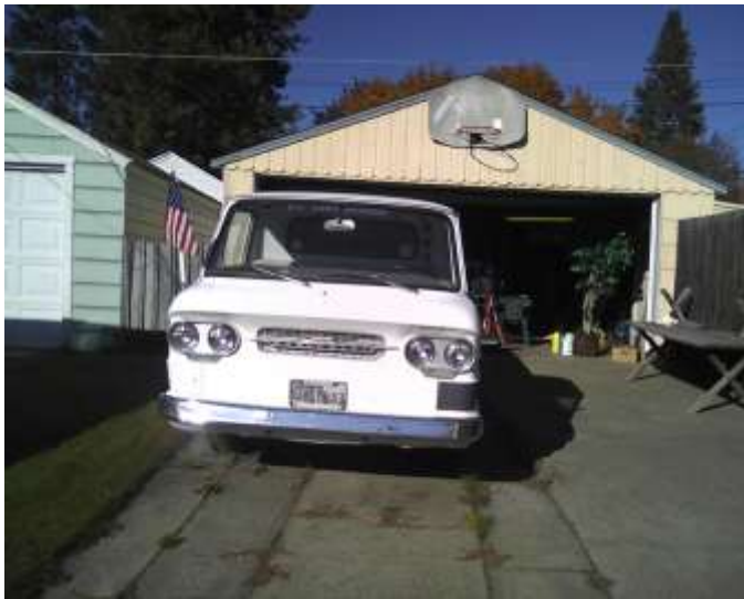
"Tim" while waiting for a new home.

For the first time in a very long time, I am getting an issue of the REAR ENGINE REVIEW out on time... or as close to on time as can be. My seemingly impossible goal is to have it out as close to the first of the month as possible.