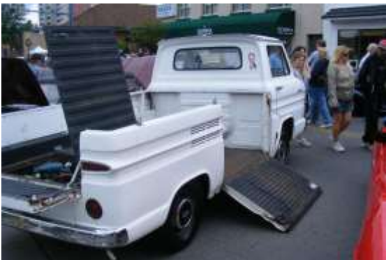
"Tim" The 1962 Rampside formerly owned by your editor at Car D' Lane several years ago.

Inland Northwest Corvair Club P. O. Box 9689 Spokane, WA 99209-9689