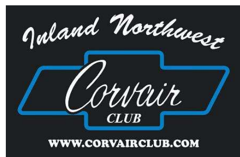
The front of the card looks like this.