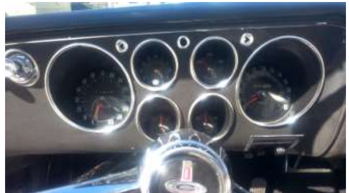
Close up of the classic Corvair instrument panel