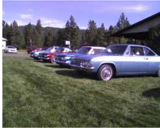
Corvairs on display at the 2013 Cider Fest

INCC Christmas/Holiday Party (Date, Hosts, and Location TBA)